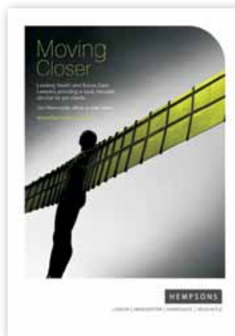
≈ Full page display advert

“We were so pleased with the Special Report we did with HSJ. The team there were great to work with and really understood the brief. We’ve had wonderful feedback and look forward to working with HSJ in future.”