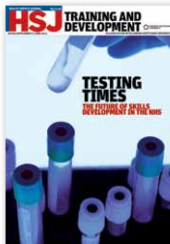
≈ Sponsored supplements

Please contact Jason Winthrop on 020 7728 3735 or jason.winthrop@emap.com for more information.